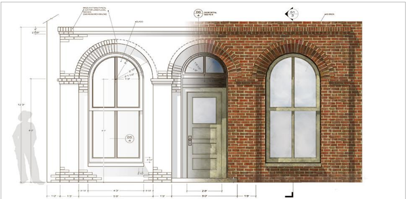
SketchUp drafting and rendering samples